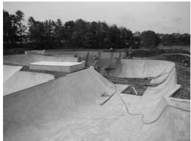
Dreamland staff put the finishing touches on a large wall that will serve as the second half of a challenging half-pipe.

(See Taxpayer Question of the Month on Page 8)